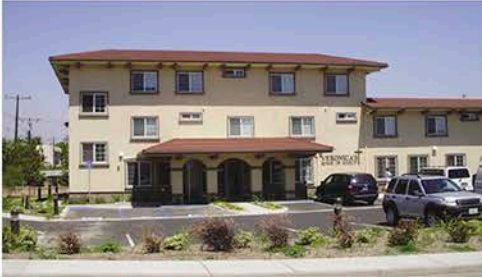
Veronica's Home of Mercy is funded in part by Arrowhead United Way