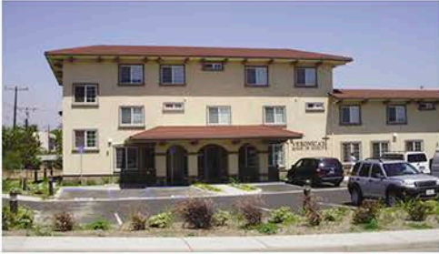
Veronica's Home of Mercy is funded in part by Arrowhead United Way