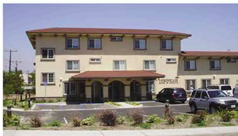
Veronica's Home of Mercy is funded in part by Arrowhead United Way